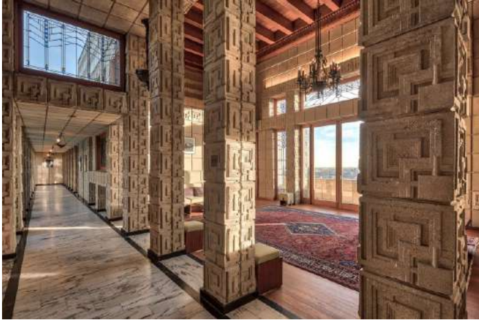
Ennis House, 1924