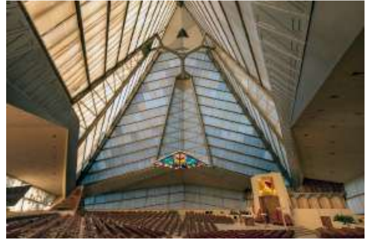
Beth Shalom Synagogue, 1954