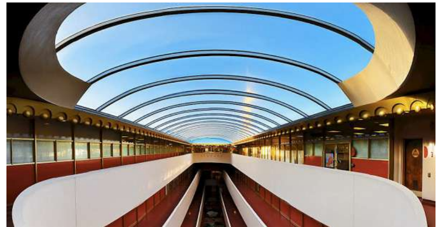
Marin County Civic Center, 1957