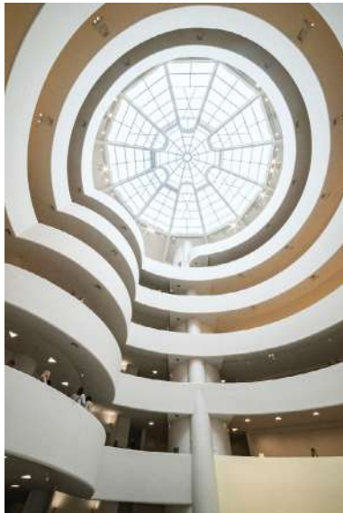
Guggenheim Museum, 1959