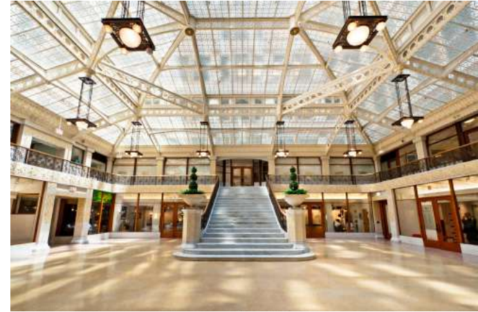
The Rookery, redesigned in 1905