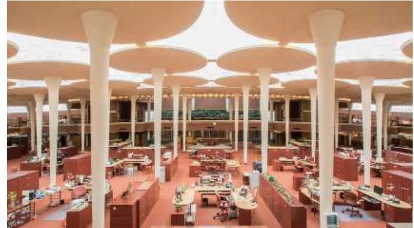
S.C. Johnson Wax Headquarters, 1936