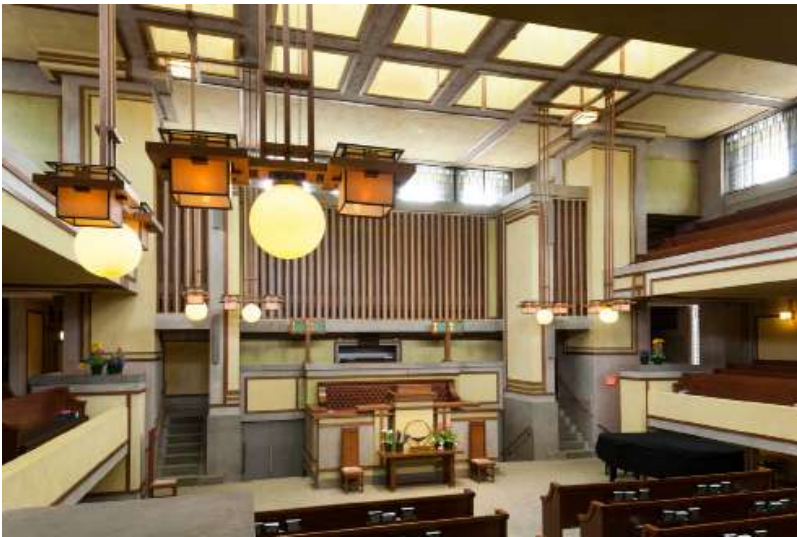
Unity Temple, 1905-08