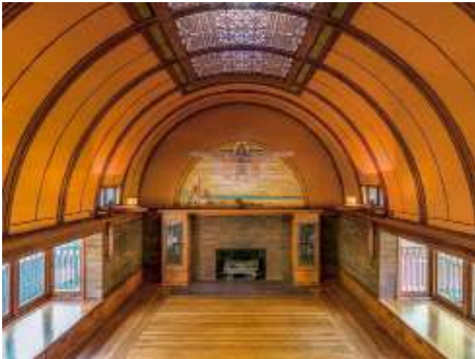
Home and Studio Playroom, 1895