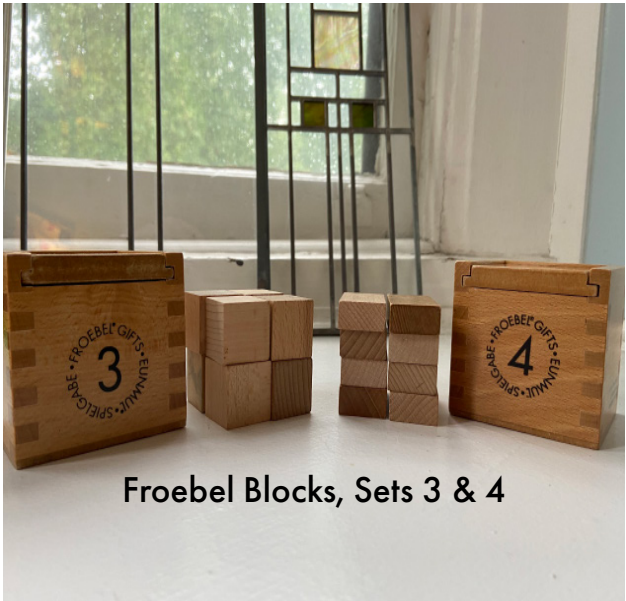
Froebel Blocks, Sets 3 & 4

When Wright grew up, he decided to become an architect. An architect is someone who designs buildings. He was inspired by his love of shapes and nature to design a new style of buildings. Wright moved to Chicago, where he designed hundreds of homes, including one for himself and his family. During his time in Chicago, Wright created the Prairie style, which is a type of architecture inspired by the long lines of the American prairie and focuses on the connection between a building and its nearby environment.